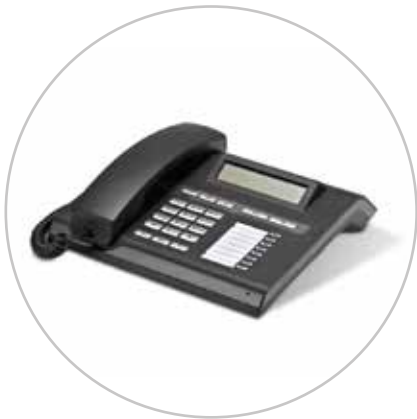
Swyx L615 Desk phone