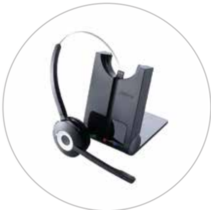
Jabra Pro 930 USB Wireless Headset