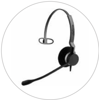
Jabra Biz 2300 USB Headset