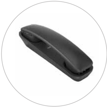
Jabra wireless USB Handset